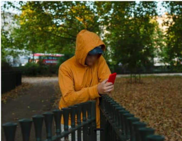
The study showed five in 100 children who had a 30% school absence record attended hospital for mental ill health.

Loughborough University and ONS study of 1 million school-age children reveals risks increase with longer absence